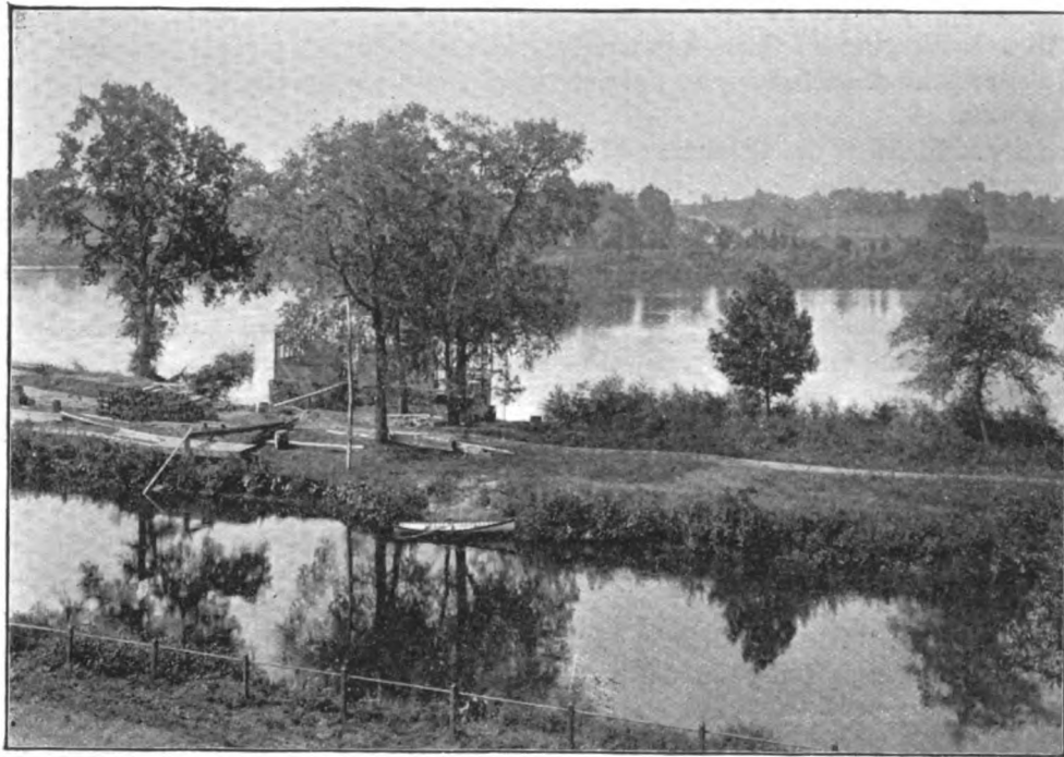
VIEW OF DELAWARE RIVER AND THE FLUME.

At Trenton, the maximum flow is estimated at 1,314 cubic feet per second under natural conditions, but 383 cubic feet per second is diverted for canal purposes, leaving 931 cubic feet per second minimum flow. Probably the river does not fall as low as this oftener than once in a generation. This gives 601,600,000 gallons daily as the supply without storage. At the last monthly flow shown by the record, the natural flow of the river at Trenton amounts to 880,000,000 gallons daily.